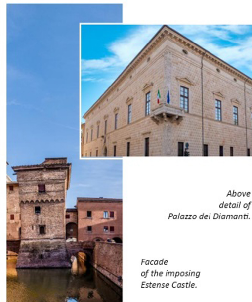
Above detail of Palazzo dei Diamanti.