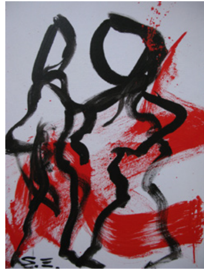
POWER OF DANCE