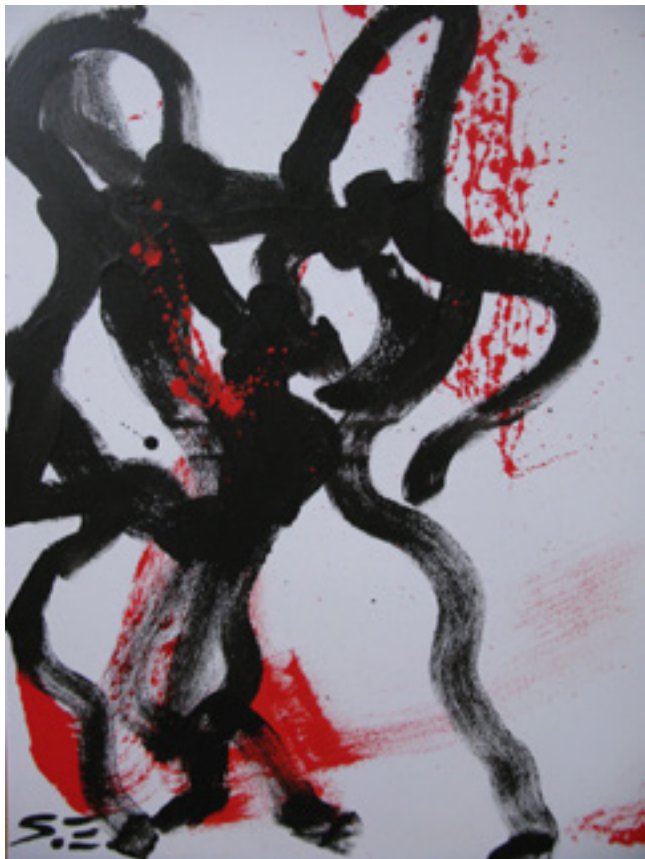
POWER OF DANCE