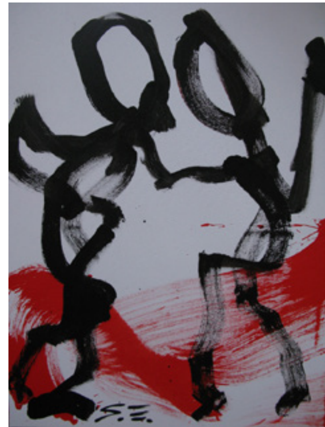
POWER OF DANCE